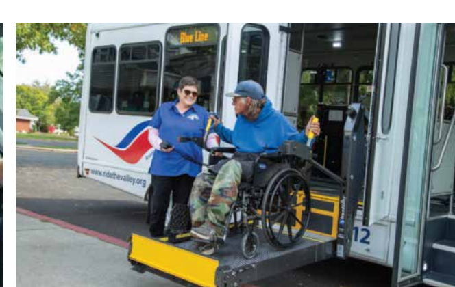
Moving across state borders, the Lewiston Transit System of Lewiston, Idaho and Asotin County Public Transportation Benefit Area (Asotin County PTBA) located in Clarkston, Washington, are helping to connect people with their communities.