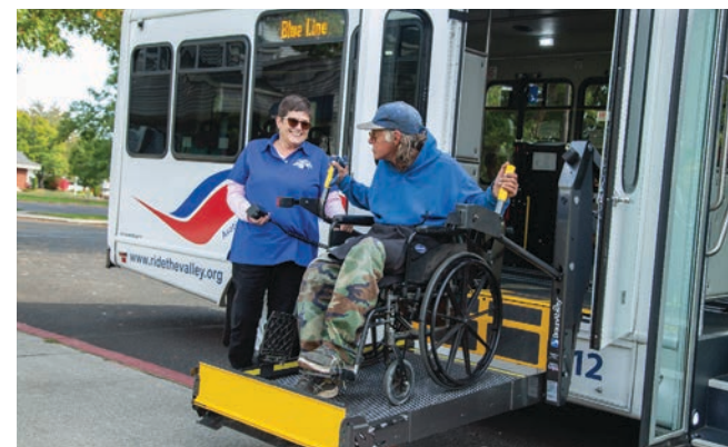
Moving across state borders, the Lewiston Transit System of Lewiston, Idaho and Asotin County Public Transportation Benefit Area (Asotin County PTBA) located in Clarkston, Washington, are helping to connect people with their communities.