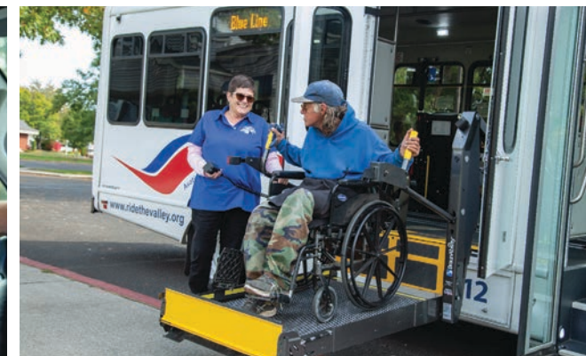
Moving across state borders, the Lewiston Transit System of Lewiston, Idaho and Asotin County Public Transportation Benefit Area (Asotin County PTBA) located in Clarkston, Washington, are helping to connect people with their communities.