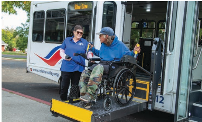
Moving across state borders, the Lewiston Transit System of Lewiston, Idaho and Asotin County Public Transportation Benefit Area (Asotin County PTBA) located in Clarkston, Washington, are helping to connect people with their communities.

Time indicated on the map reflects the earliest departure from each stop.